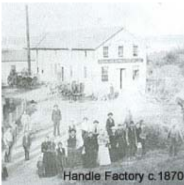
Handle Factory c. 1870

Just because the Museum closes for the winter doesn't mean that our programming will end! Join the Cedar Lake Historical Association for these special programs: