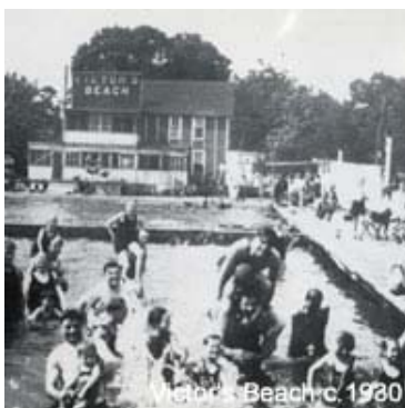
Victor's Beach c. 1930